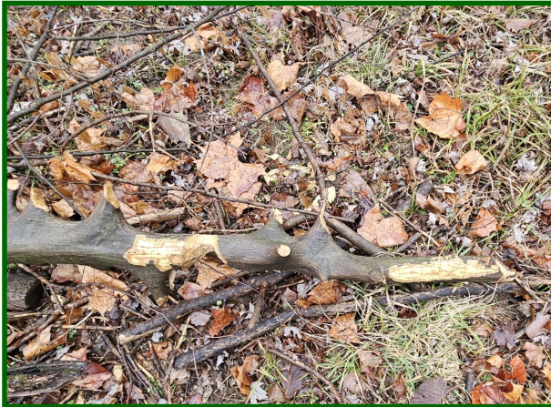
Beaver returned, hornbeams now all fenced