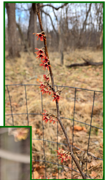
Two types of Witch-hazel bloom in February