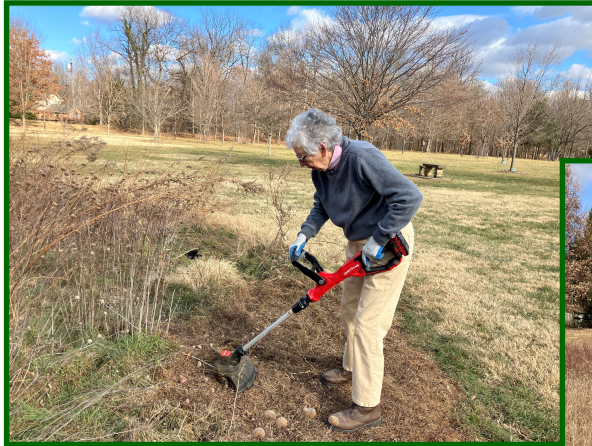
Seeding task, Kill grass, weedwhack, spread new seed