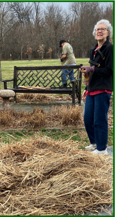
Cutting grasses at the turtle area