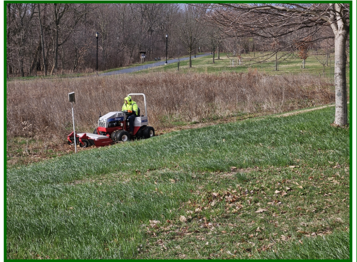
Each year the City cuts the meadow