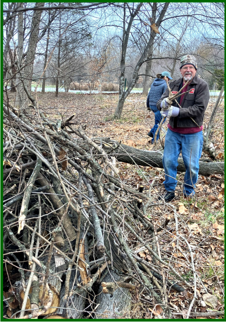
Making wildlife piles after cutting up downed tree