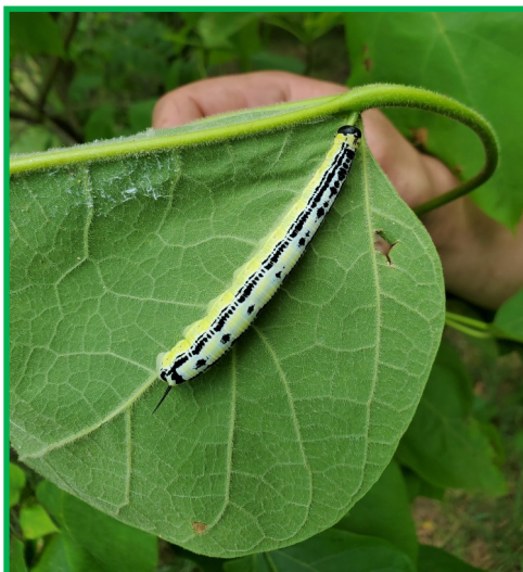
This critter eats Catalpa leaves .