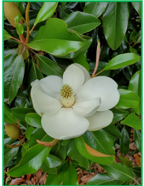
Magnolia on the hill