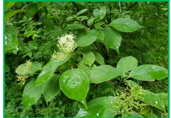
Gray dogwoods, not showy but important bird food