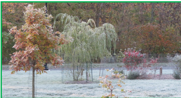
One of many excellent frosty fall mornings

The mainstay of FWP's park efforts remains the hundreds of hours devoted each year by worker bees. This year we installed several new birdhouses and monitored them in the spring, trying to stay ahead of the sparrows' nesting efforts.