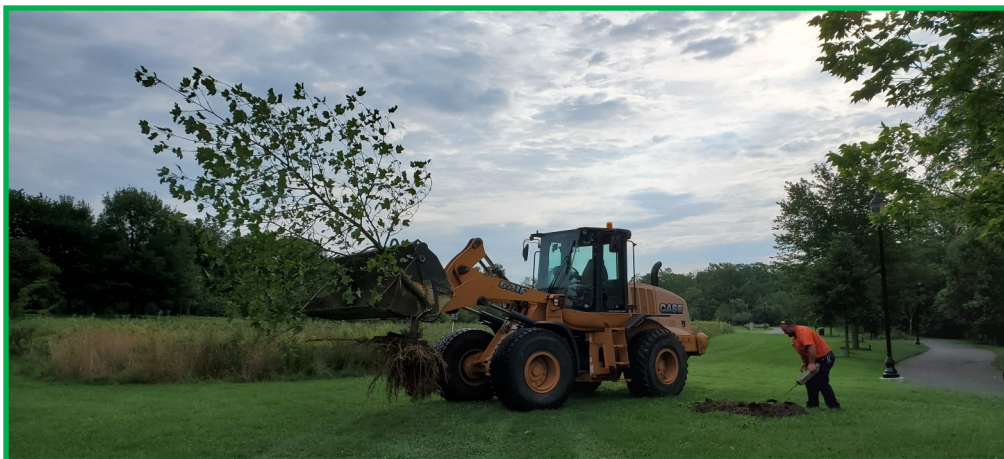
City removed diseased poplar