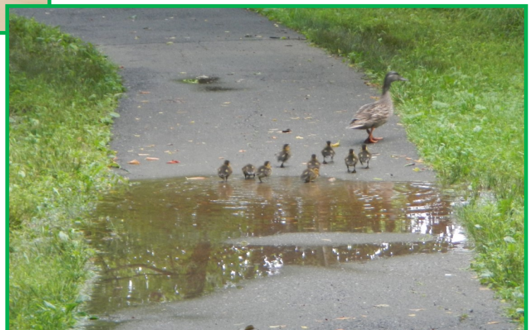
Wildlife in Waterford