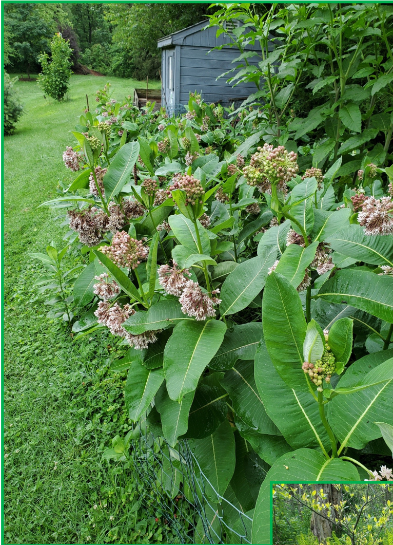
Helping the monarchs