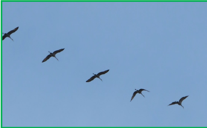
Jerry spotted sandhill cranes overhead in November.

Our members continue to support this group and this park with dues and donations. This year your donations totaled more than $3,000. A special thank you to Carol Zehnacker for her generous contribution (not included in the above total). Our Community Foundation FWP fund has really grown. It started at $25,000 and is now over $37,000. Members in 2021 added $785 to that fund. This year we received over $1,800 as the annual distribution. The CF money goes into our ash treatment; the 2021 treatment was a little over $3,000 to treat about 3 dozen trees. We will need at least one more treatment scheduled for 2023. Each year the Cross Foundation supports our work. For long-term maintenance, the fund at Morgan Stanley is now approximately $30,000. FWP is in sound financial shape and should stay that way as we continue to transition to more maintenance done by vendors.