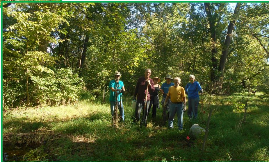
Planting along old sewer line