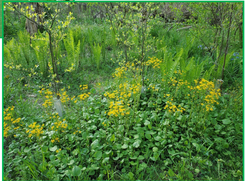
Golden ragwort - great groundcover