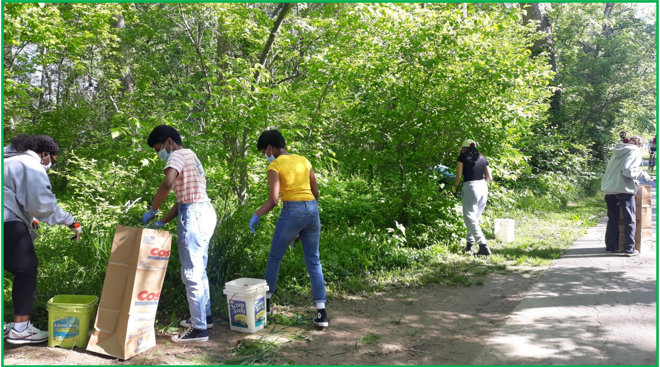
FHS students clearing groundcover