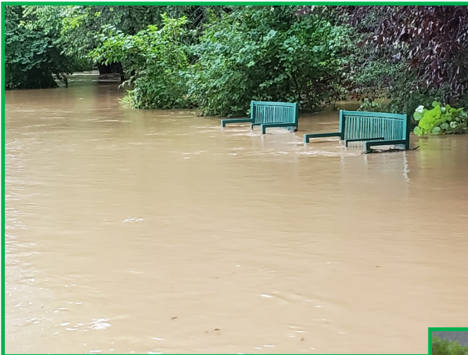
Flooded park - again!!