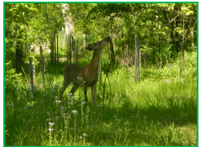
One of many in the park this year