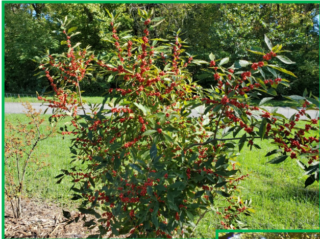
Hollyberries will be eaten soon