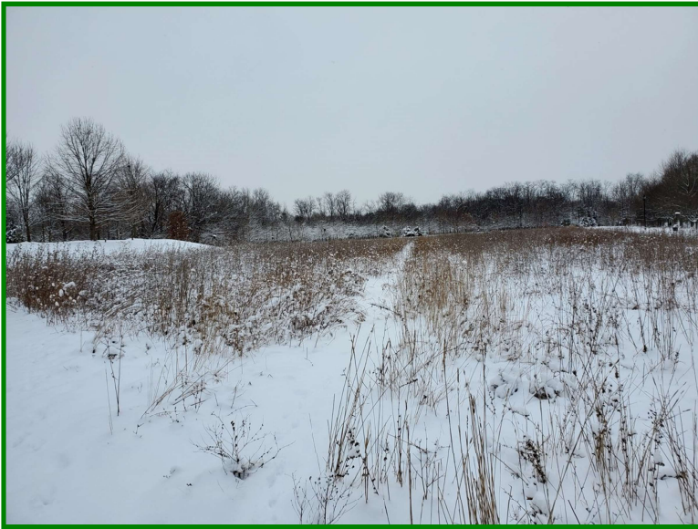
February snows revealed the path deer made through the meadow.