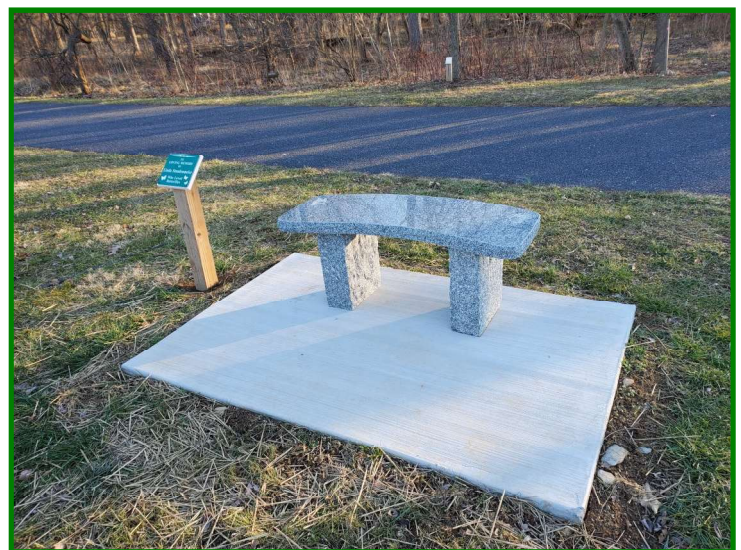
Early spring: new bench and sign facing the meadow and butterfly signage are in place.